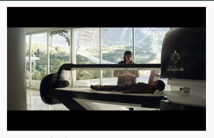
From Elysium (2013) movie. How absurd can DRM get?